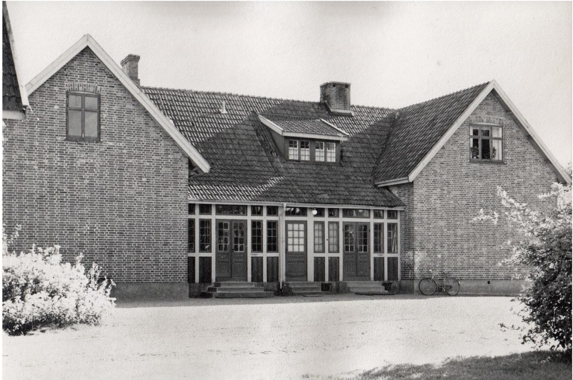
Björbäck skola, foto troligen från 1950-talet